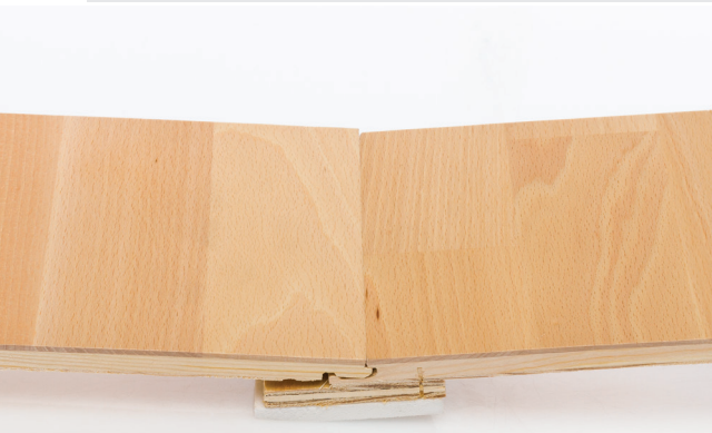
Encore Elite Patented Click-And-Lock System